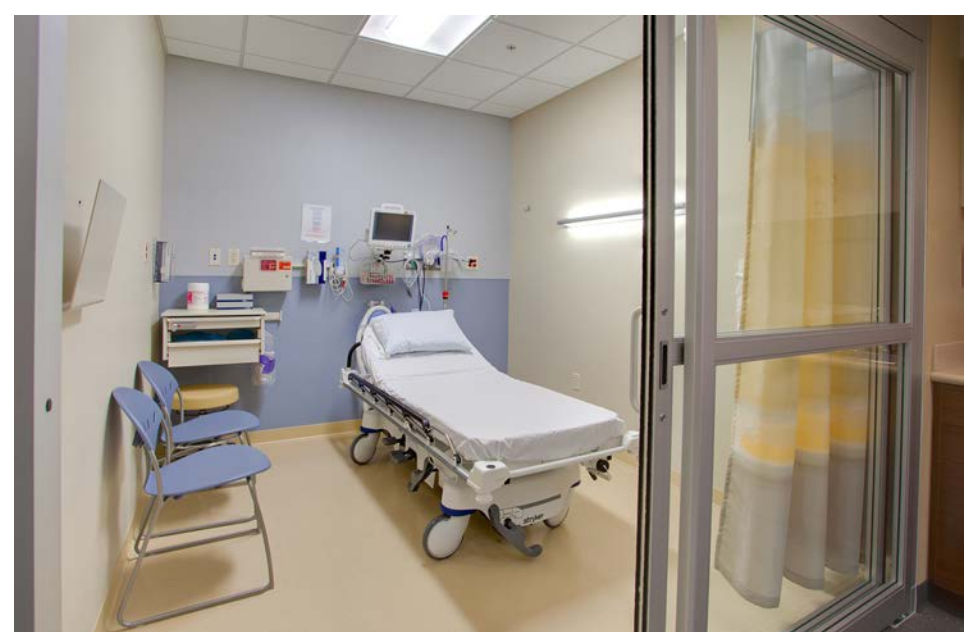
PreOp Room

Like Target in Minnesota or Wal-Mart in Arkansas, sometimes the key to delivering consistently high quality services and products is logistics. Twin Cities Orthopedics, like other innovative health care providers in this country are exploring innovative, even disruptive, approaches to changing healthcare delivery in the United States—despite what happens in Washington. •