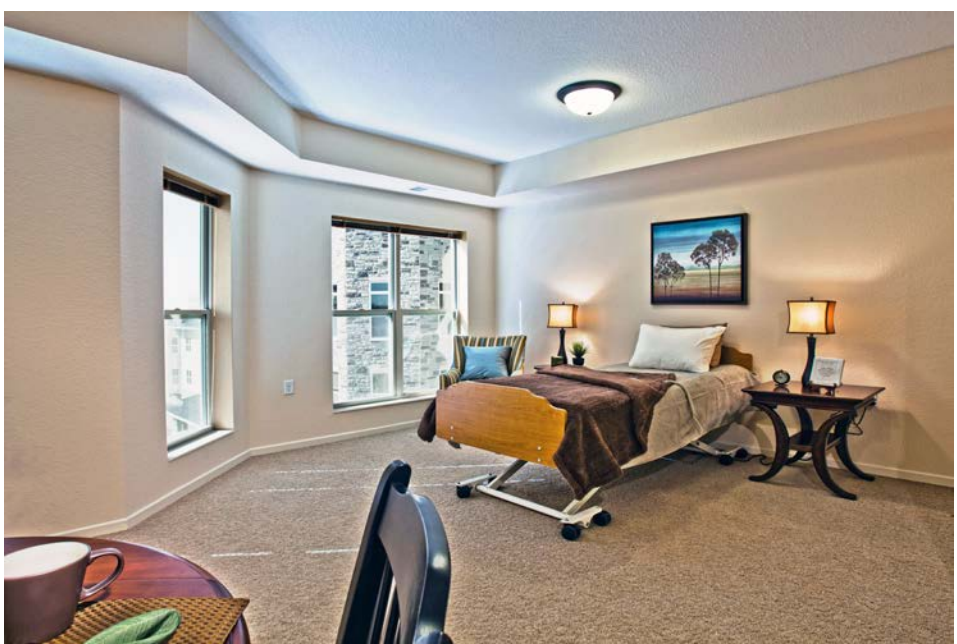
York Gardens Premium Recovery Suite